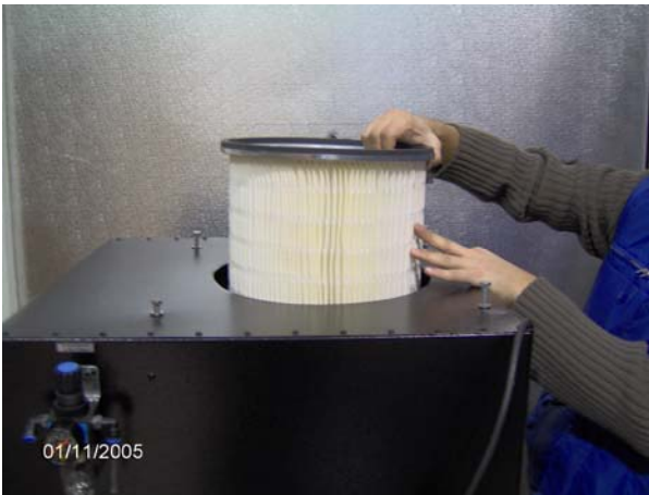
Cylindric-filter on machine