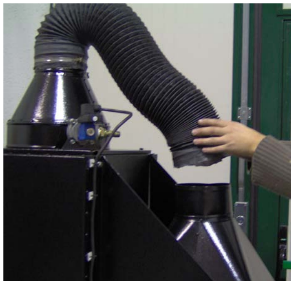
Place the accordion pass tube both side and fix them using pipe-clip