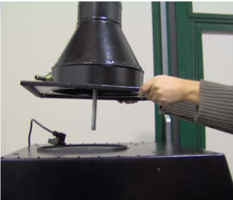
Take out the screws- place filter cover