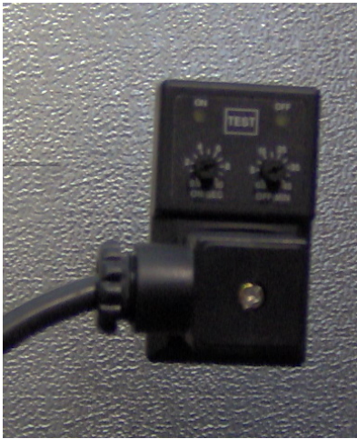
Timer to clean Cylindric-filter