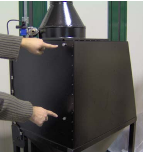
Take out the screws from rear of the machine and place the back unit using the screws