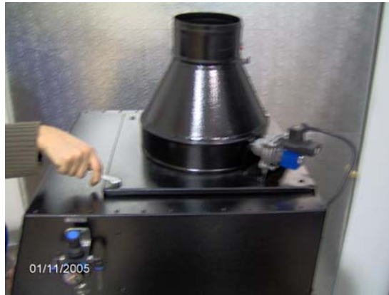
Place the screws and fix it