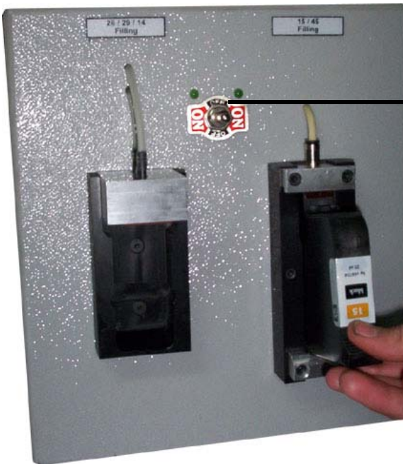
Place the cartridge in to the 15/45 filling station.