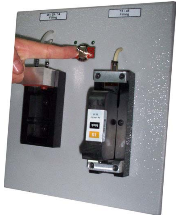
Flip the mode switch to 15/45 filling position.